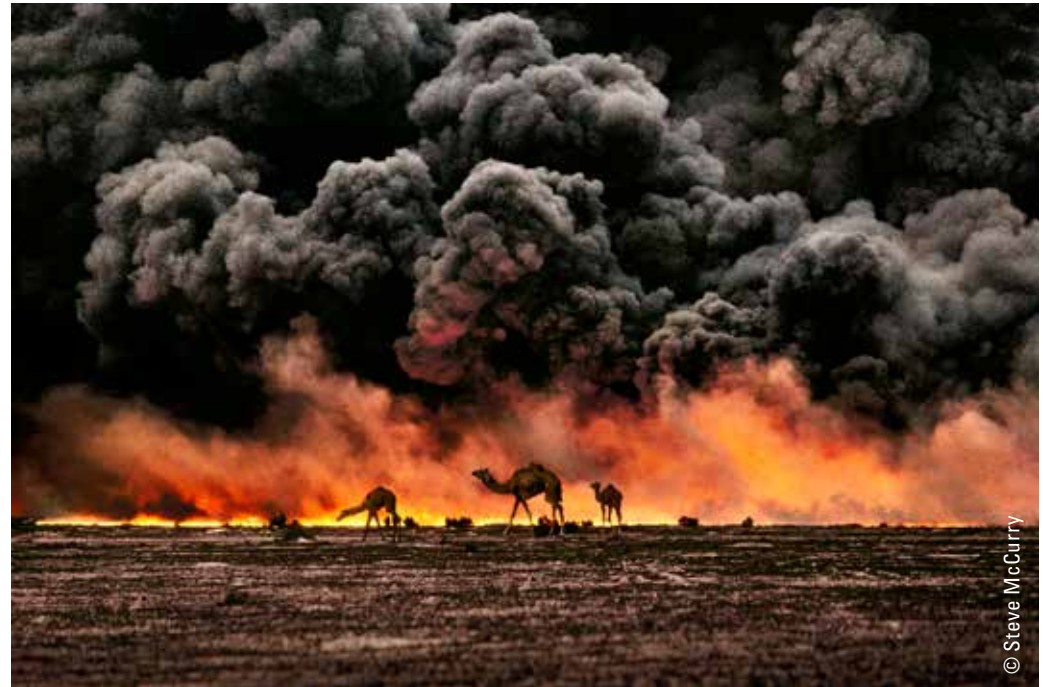
Al Ahmadi oil field, Kuwait, 1991