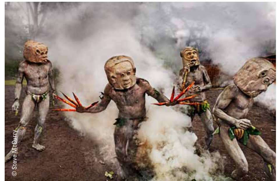
Papua New Guinea, 2017