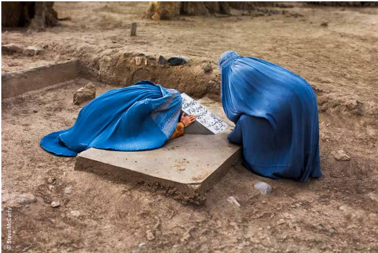
Bamiyan, Afghanistan, 2007

Hazara women mourn at a grave. Decades of war have produced two million widows who struggle to eke out a living to feed their children.