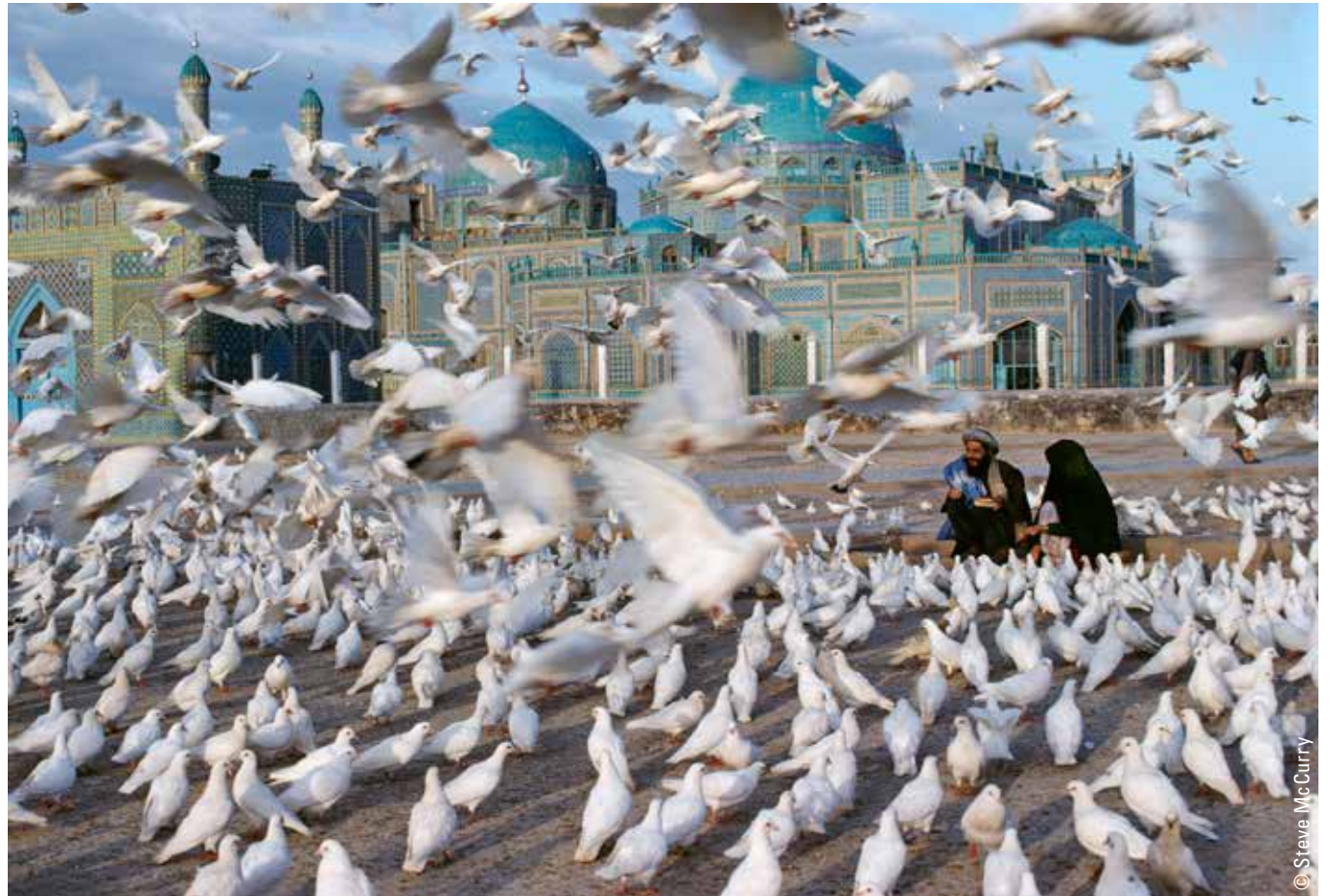
Mazar-i-Sharif, Afghanistan, 1991

Doves in front of Mazar-i-Sharif's 'Blue Mosque,' the Tomb of Hazrat Ali. The white doves are often fed by pilgrims that visit this holy site.