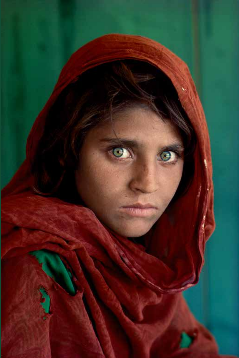
Peshawar, Pakistan, 1984.