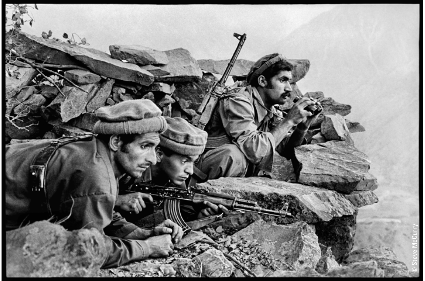
Nuristan, Afghanistan, 1979

This group of Mujahidin stopped on a rocky ledge high in the mountains to watch and track a convoy of soldiers on the road below in Nuristan, Afghanistan.